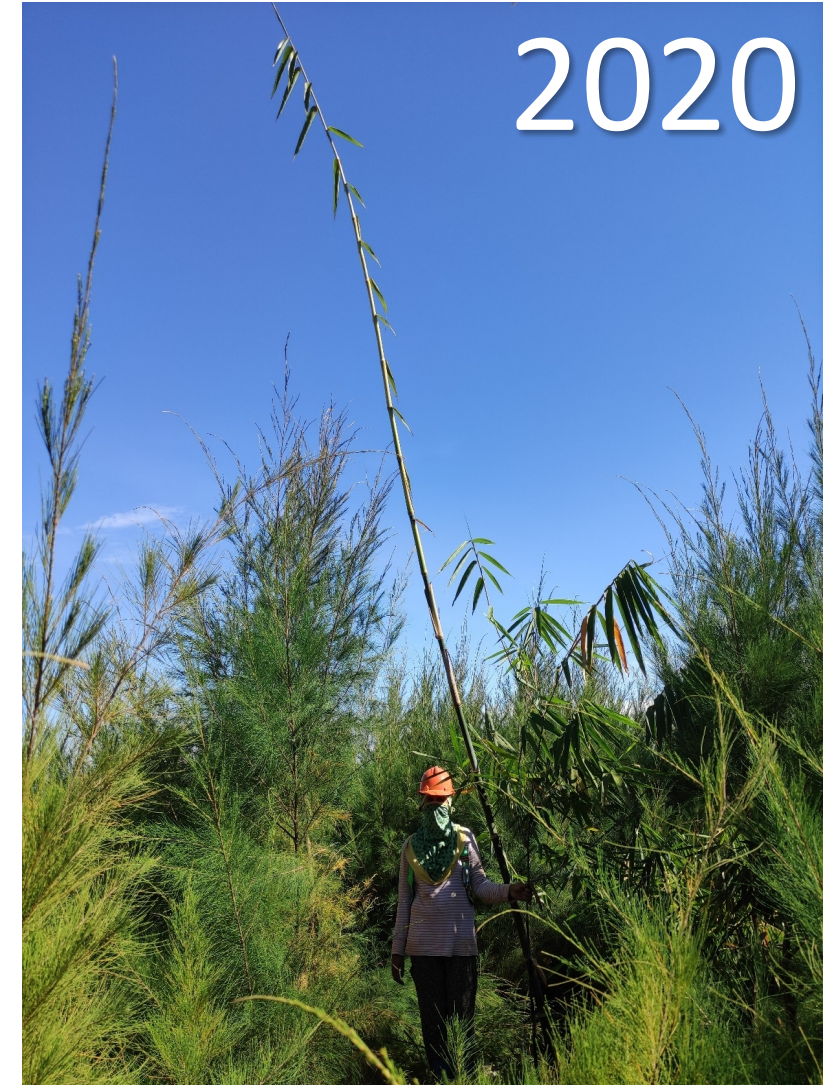
Area 2 mined-out area