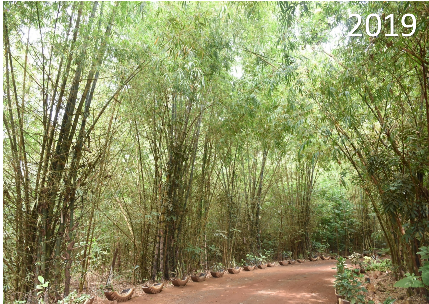
Rehabilitated Mined-out Area in Guintalunan Pit