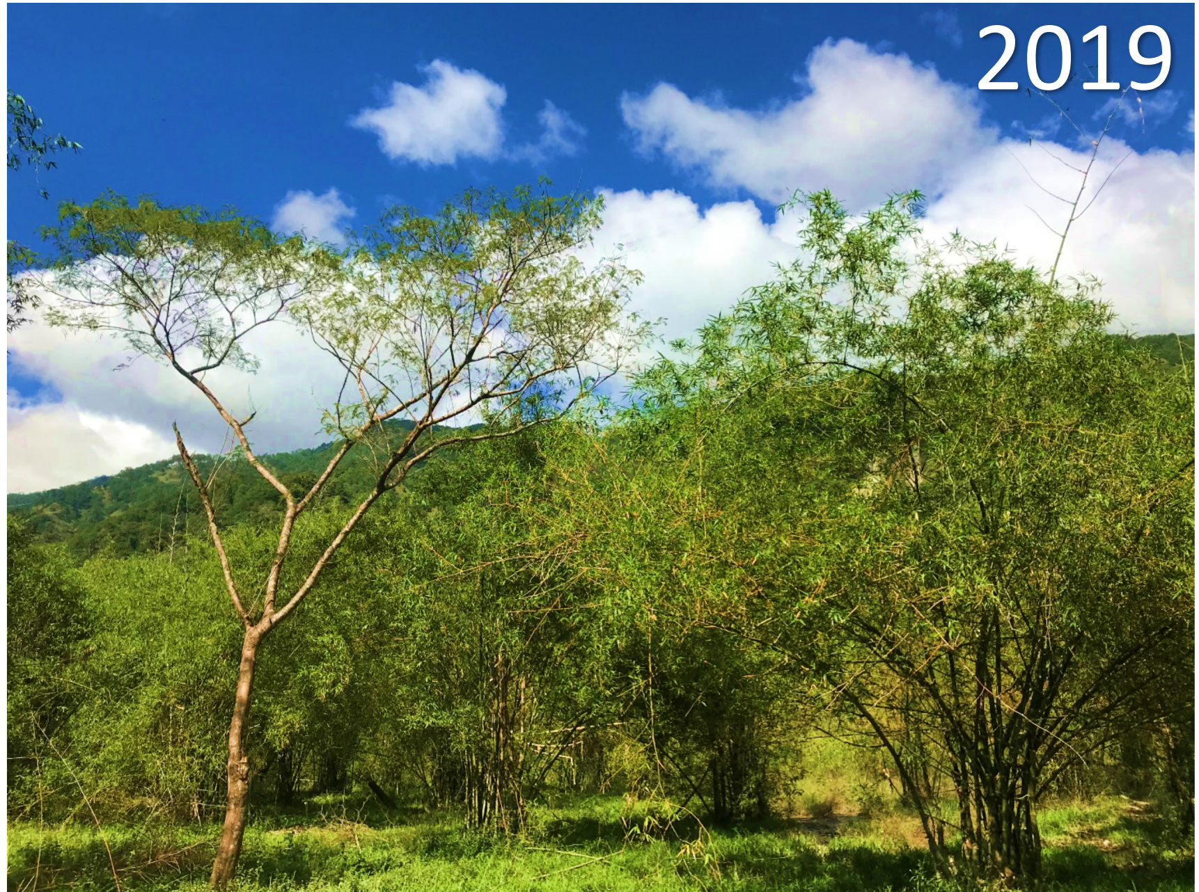
Decommissioned Tailings Storage Facility No. 1