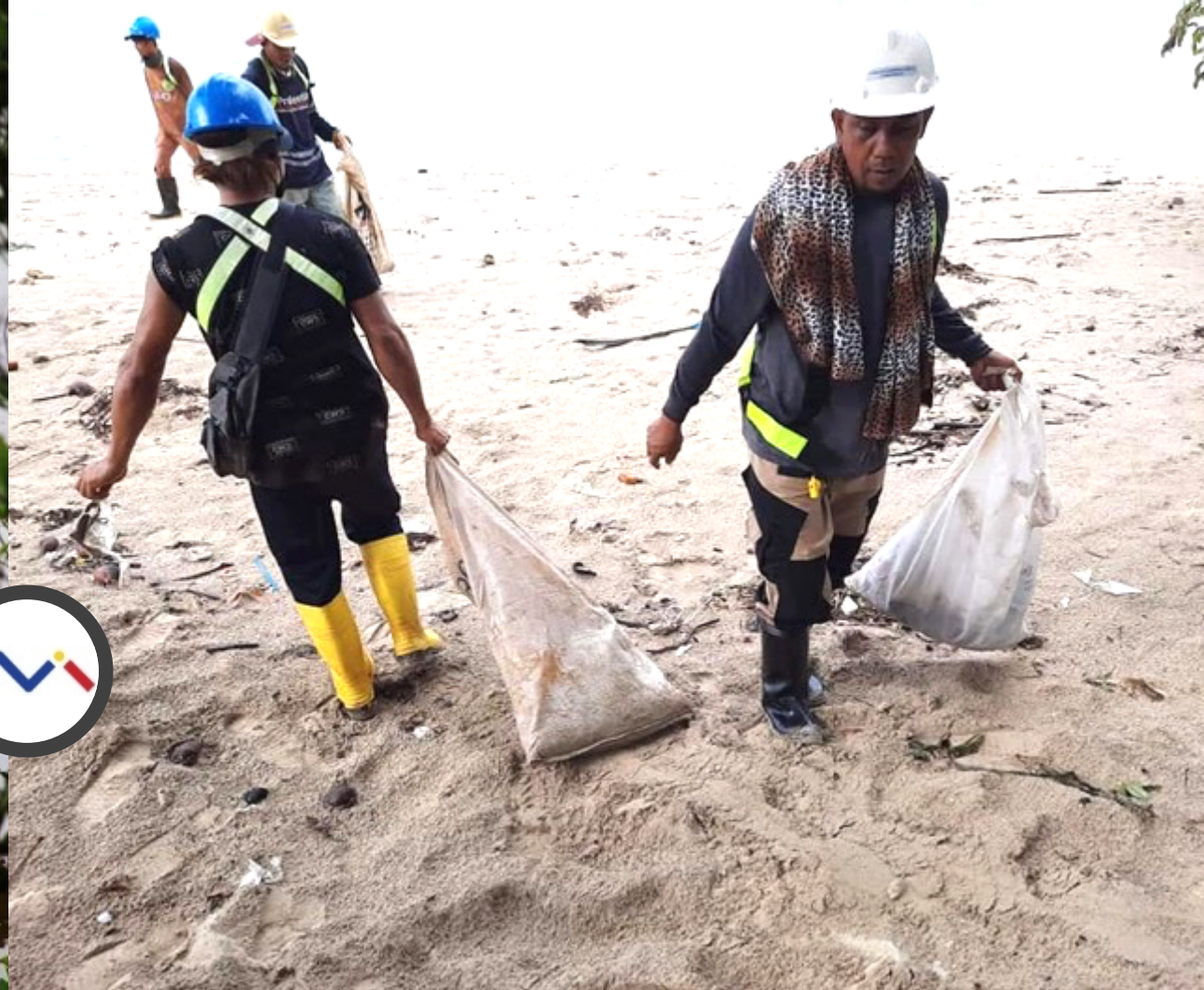
PNIA companies conducted 17 coastal and river clean-ups this 2020 in Surigao del Sur, Surigao del Norte, Agusan del Norte, Zambales, and Palawan.