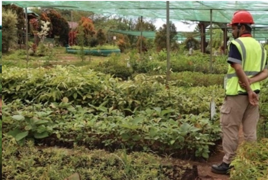
Nursery in Agusan del Norte