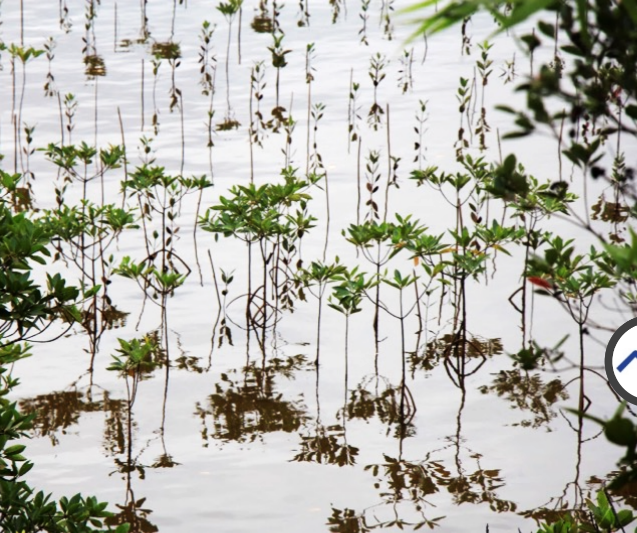
As of August 2020, 94,970 mangroves have been planted by PNIA mining companies in line with their rehabilitation efforts.