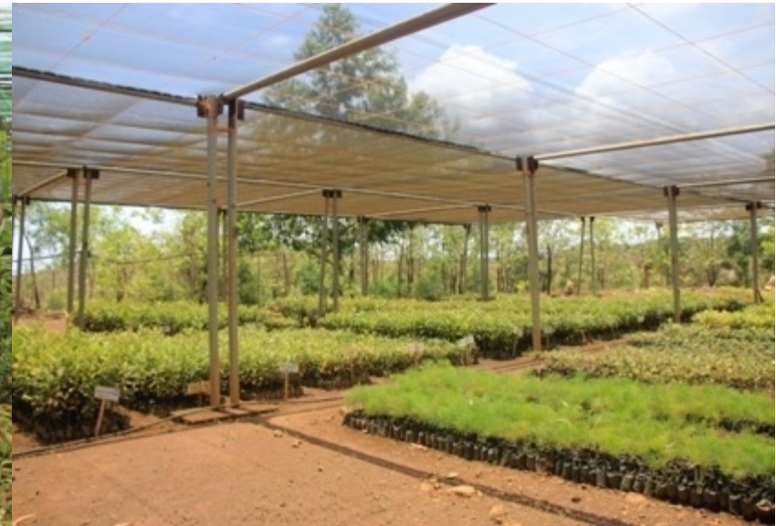
Nursery in Carrascal, Surigao del Sur