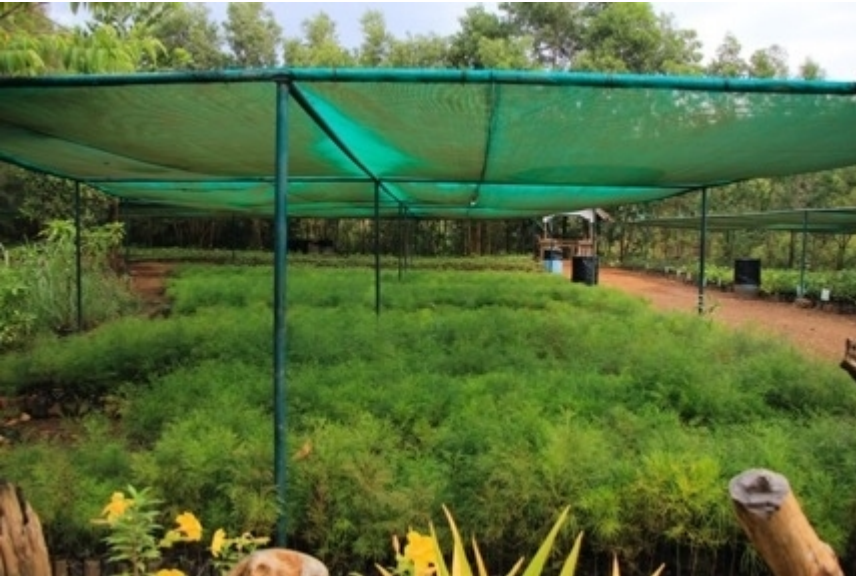
Nursery in Claver, Surigao del Norte